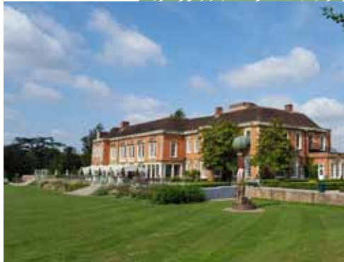
West Berkshire, running into the Wessex Downs